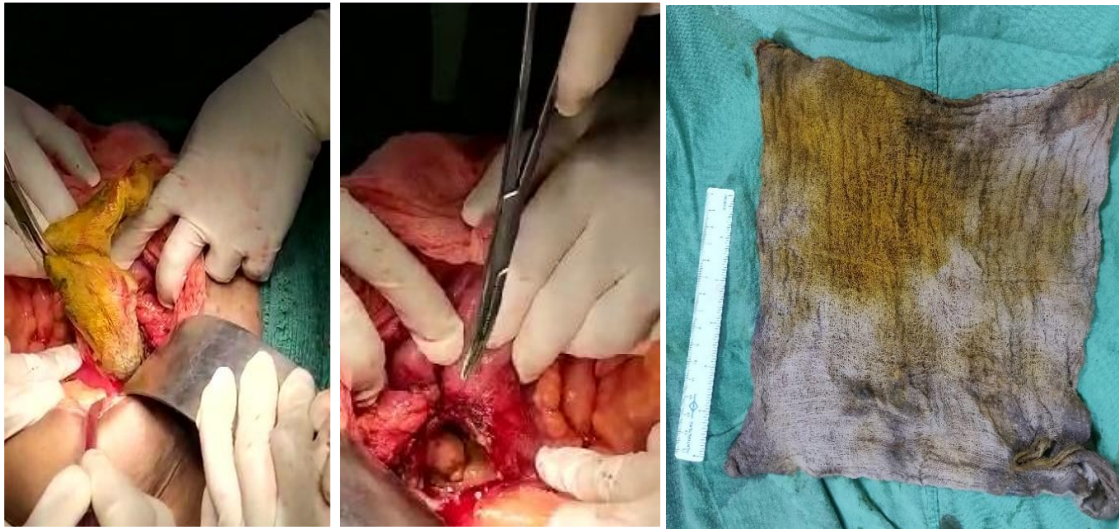
Fig. 2. Surgical sponge extracted from the lumen of bowel

ileocaecal junction) – explaining the presence of faeces in the rectum despite diversion colostomy. The sponge was present in the lumen of both terminal ileum and sigmoid colon. The fistula tract could not be approached due to dense fibrosis in the region.